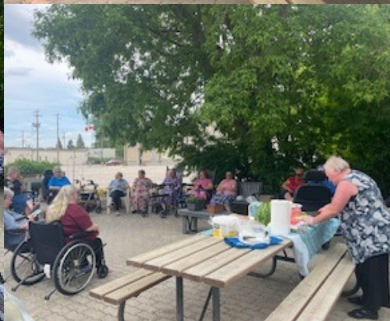
Tenant and their family are enjoying a lovely meal together on the patio.