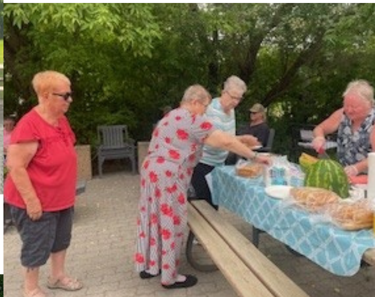
Ice Cream bash was also the perfect way to cool down during warm weather!